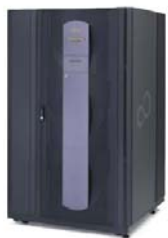
TPS ® /3270 (BSC)