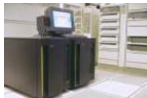
Mainframe / Host System